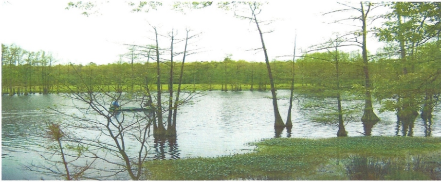
Broken Bow, Oklahoma

We are planning on you being with us, and you having a wonderful time, at Church Camp 2011. There will be wonderful fellowship with your brothers and sisters in Christ from across the country. There will be activities for all. Come one come all; see who can bring the most people with them. Please note we want everyone to be able to attend the camp meeting at Cypress Lake Campground. We are trying to make the dates so as many people as possible can attend. ( PLEASE note a change of dates that came out in the September Christian Courier )